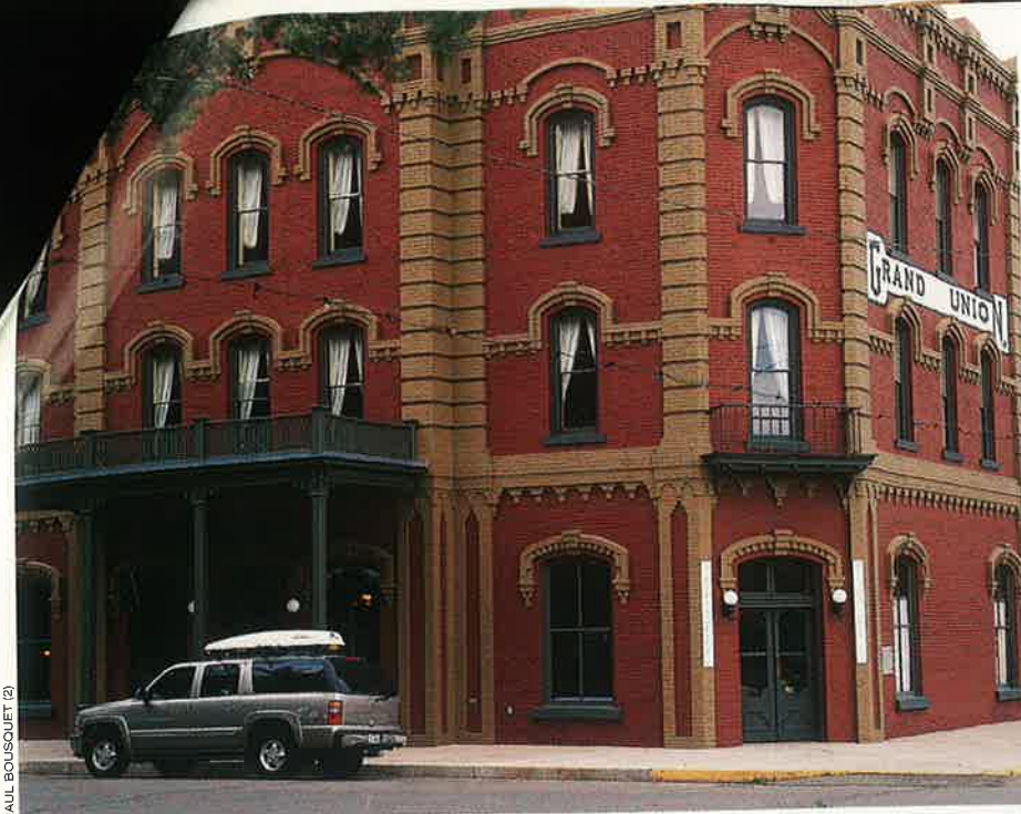
PAUL BOUSQUET (2)