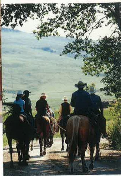
A redbrick reminder of Fort Benton's proud past, the Grand Union Hotel has been elegantly restored. Below, guests begin a ride at Circle Bar Guest Ranch.

Montana and you will come to understand, and love, the landscape that shaped his life and art.